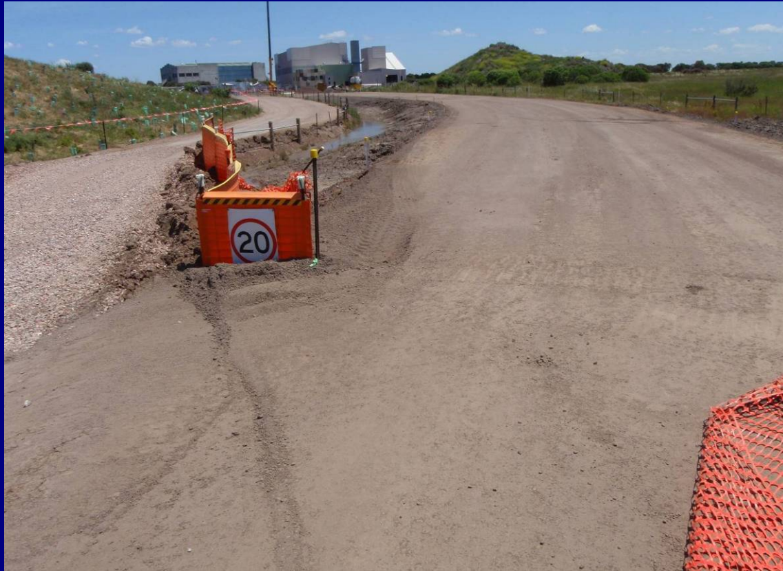
Access road base courses laid.