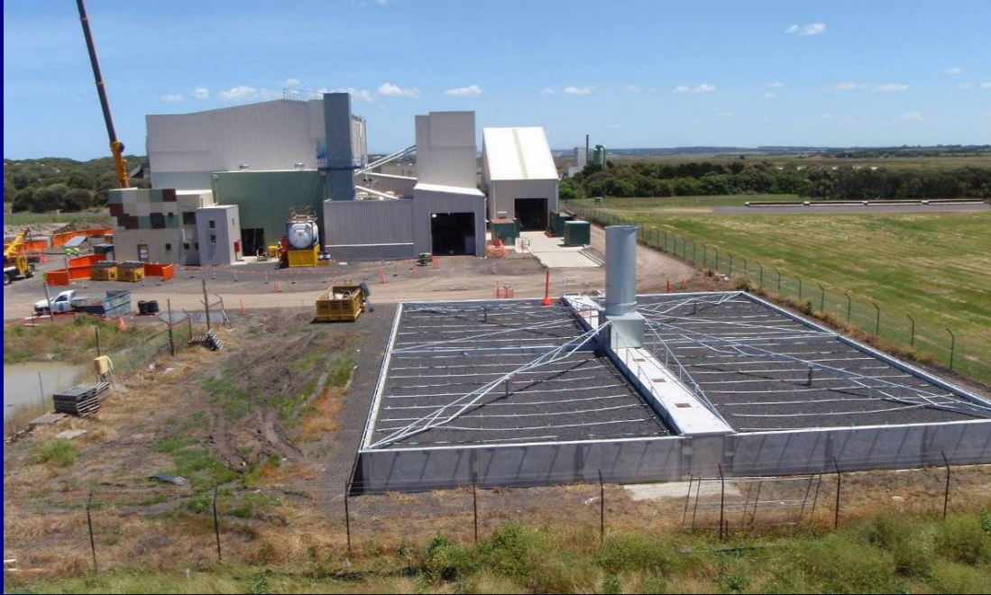
Front view of the Biosolids Treatment Facility.